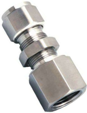
Dimensional Details :